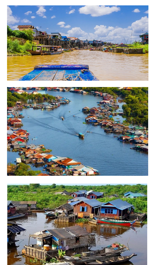
* Breakfast – Lunch – Dinner - Hotel 4* (Visit to the River Village by boat - Cambodian dinner)